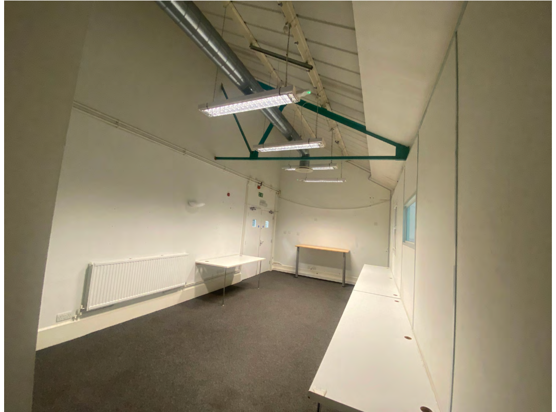
Studio 8 Large studio with some natural light.