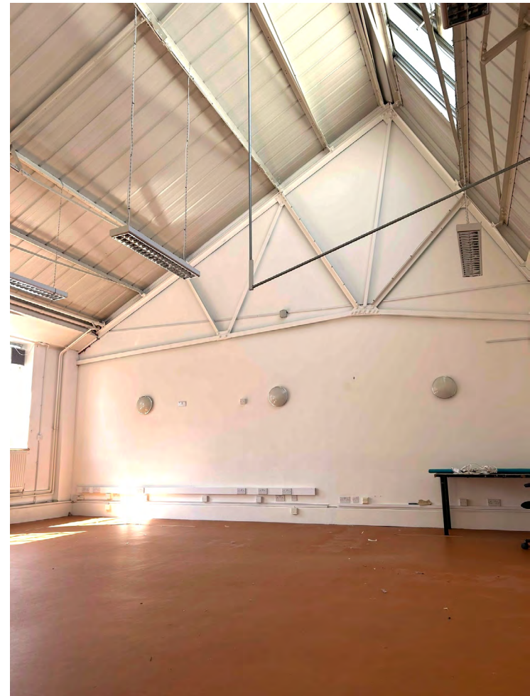
Studio 4 Large studio with north and south light and high ceiling