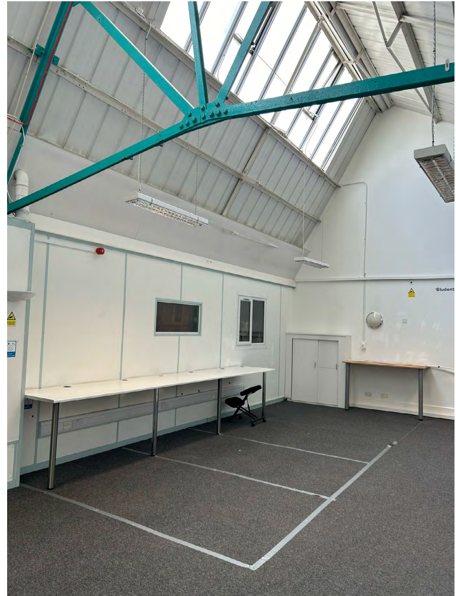
Creative desks £80 a month plug sockets, natural lights, some storage space around the desk